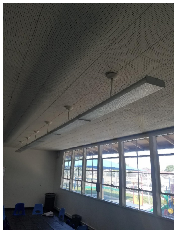
END OF ADDENDUM